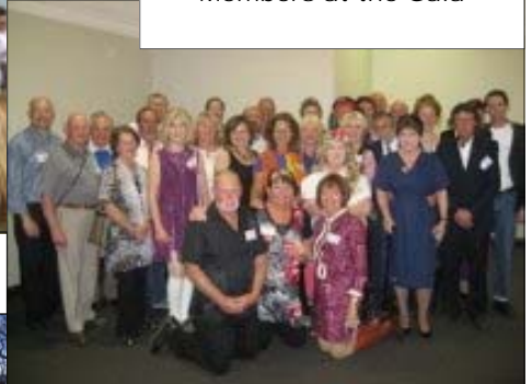
Group Photo of A30 Members at the Gala