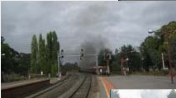
Steam Train with 1930's Carriages on way To Historic Maldon