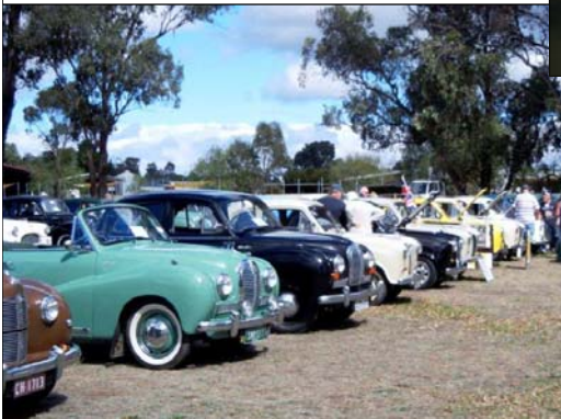
Line Up of A30's on Sunday