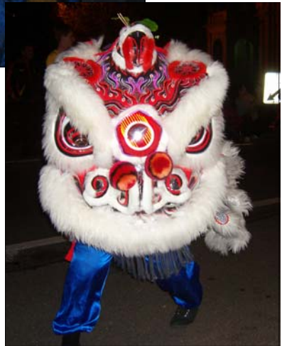
All three photos are part of the Torchlight Procession