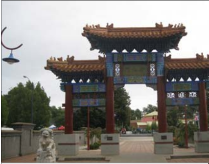
Gateway to Chinese Precinct