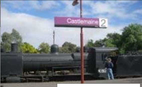
Steam LocoK190 At Castlemaine Station