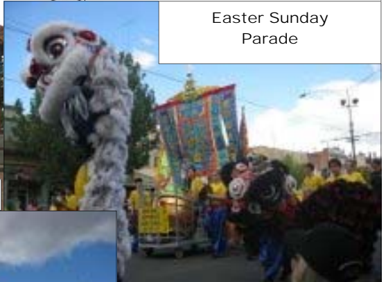
Easter Sunday Parade