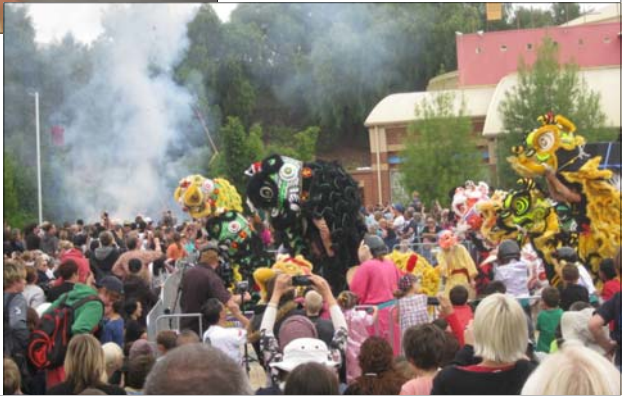
Awakening of the Dragon with 100.000 firecrackers