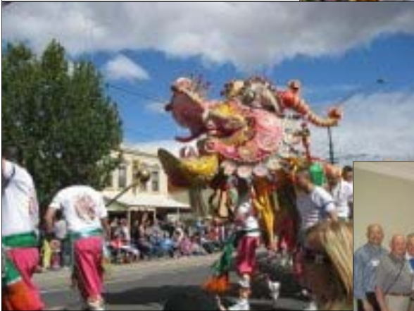
Sun Loong Dragon 100m long